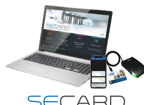
SECARD configuration kit and SSCP®, SSCP2 & OSDP™ protocols