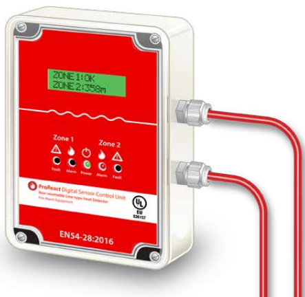
ProReact Digital Sensor Control Unit (DSCU-EN)

Thermocable's ProReact Digital Sensor Control Unit (DSCU-EN) is an EN54 certified dual zone alarm point distance locating module that is compatible with the ProReact EN Digital LHD range of cables. It can monitor up to 2,000 metres (6,562 ft) across two zones of digital LHD cable. It contains the popular interlock detection mode from the ProReact Digital Interface Monitor Module (DiMM) that reduces the possibility of false alarms.