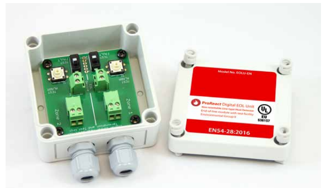
ProReact Digital End of Line Unit (EOLU-EN)

Thermocable's ProReact Digital end of line unit with test facility has also been certified to EN54-28:2016 and enables users to undertake hassle-free functional testing of the system. Users can verify normal conditions, trouble and alarm functions of a system by simulating a break in the cable or overheat condition.