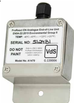
ProReact EN Analogue End-of-line Unit

The ProReact EN Analogue End-of-line Unit is compulsory in all ProReact EN Analogue LHD systems as it has a key role in the operation of the technology, allowing the control unit to detect a short circuit or open circuit in the sensor cable. It is small in size and is straightforward to be mounted on surfaces.