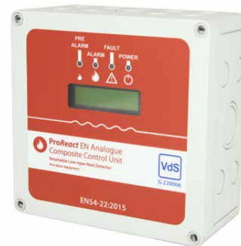
ProReact EN Analogue Composite Control Unit

More information relating to Thermocable's ProReact EN Analogue Composite Control Unit can be found in the product datasheet or installation manual, both of which are available on request.